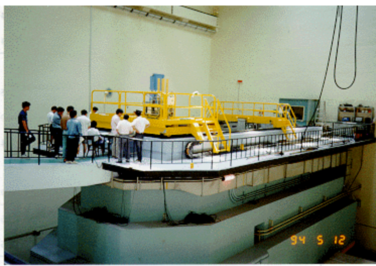
Figure 1. The reactor hall of the Tsing Hua Open-pool Reactor (THOR)

THOR is a 2 MW, light water moderated and cooled reactor of the TRIGA conversion type (as shown in figure 1). The average thermal neutron flux in the core is about 1 \times 10^{13} n/cm 2 /sec at 1 MW. It is now the only nuclear research reactor that can provide stable and continuous bulk quantity of neutrons in Taiwan.